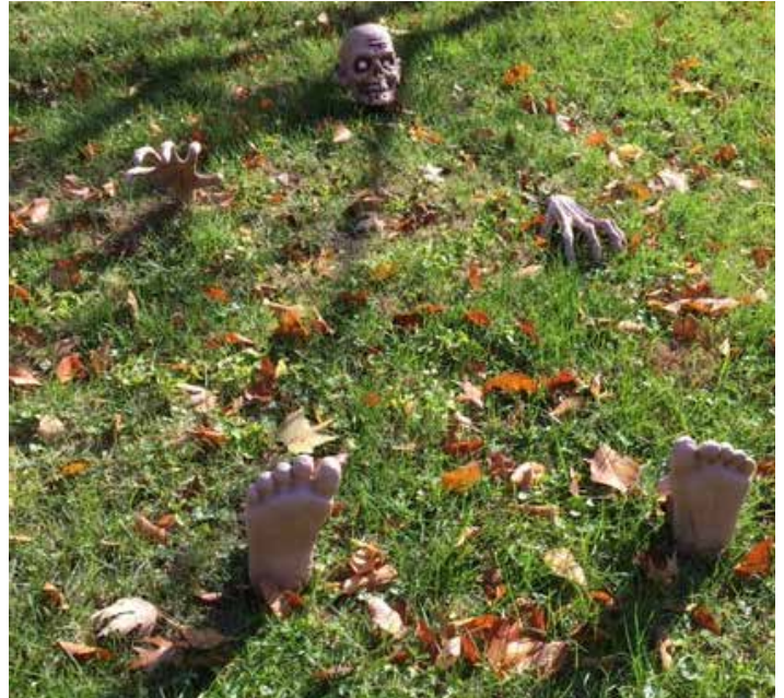
The winner of the Funniest/Scariest house decoration is this front lawn on Tanglewood Drive