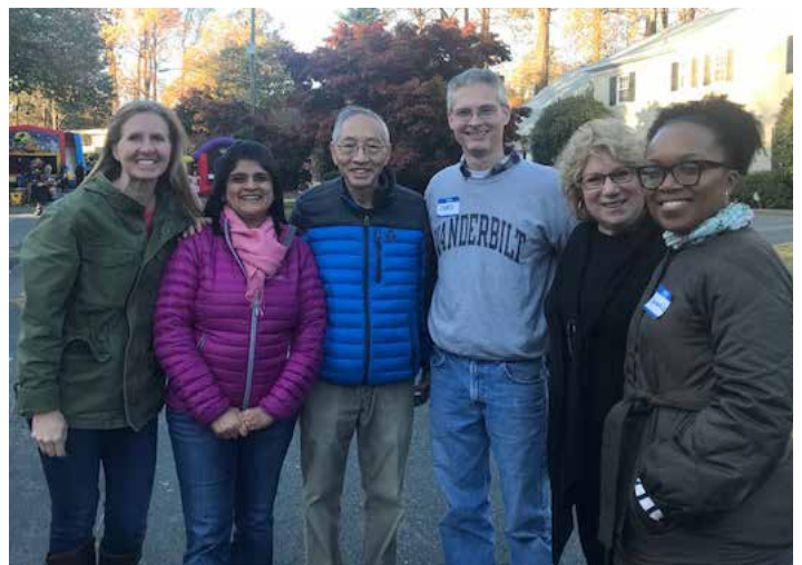
Adults had fun at the Fall Festival, too!

2019 saw a few crimes in Kenwood Park, but fewer than in nearby neighborhoods. We had one burglary/ breaking and entering incident on Whittier Blvd, in October. We had several thefts from parked cars around the neighborhood. Theft from cars accounts for a third of all the larcenies in the county. We had a few other incidents the police labeled larcenies, and crime against property, and one postal larceny. We are not counting all the crimes in the high school. Be sure to lock your car door or your garage door, and support our security patrol so we can have more patrol hours.