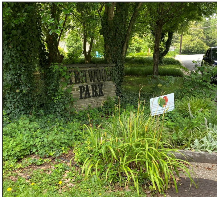
Goldsboro Road Entrance to Kdenwood Park