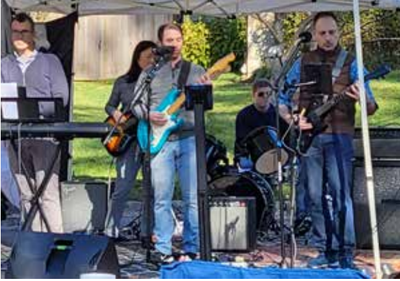
Band called "Adult Swim"

This past summer we had a couple of Front Yard Friday events, and then a Fall Festival. We missed our annual July 4th parade for lack of a coordinator, so if this has been enjoyable for you and your family, please volunteer to help next July by letting us know at news@kpc-online.org .