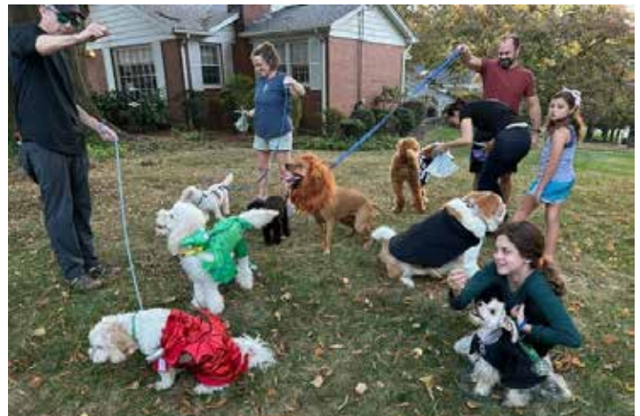
The Halloween Doggie Parade, 2023

If you see any of these symptoms in your dog or need more information please contact your veterinarian.