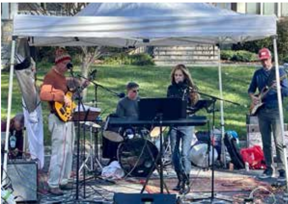
Band called "No Idea"

The Fall Festival took place on November 18th in Marbury Court. On a pitch-perfect autumn day, with clear blue skies and plenty of sunshine, Kenwood Park neighbors and their family members and friends gathered to listen to live music and enjoy free food and