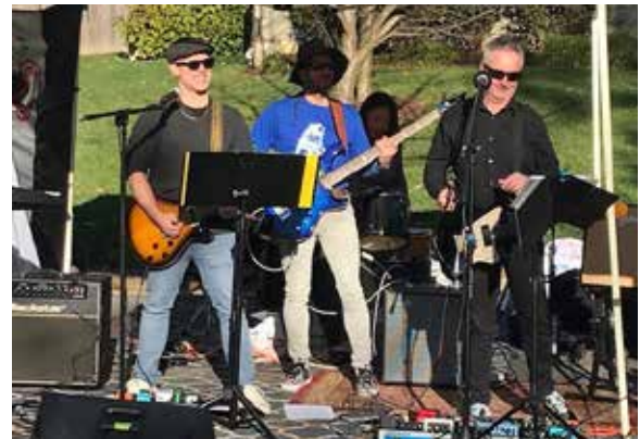
Band called "St. Elmo 4"