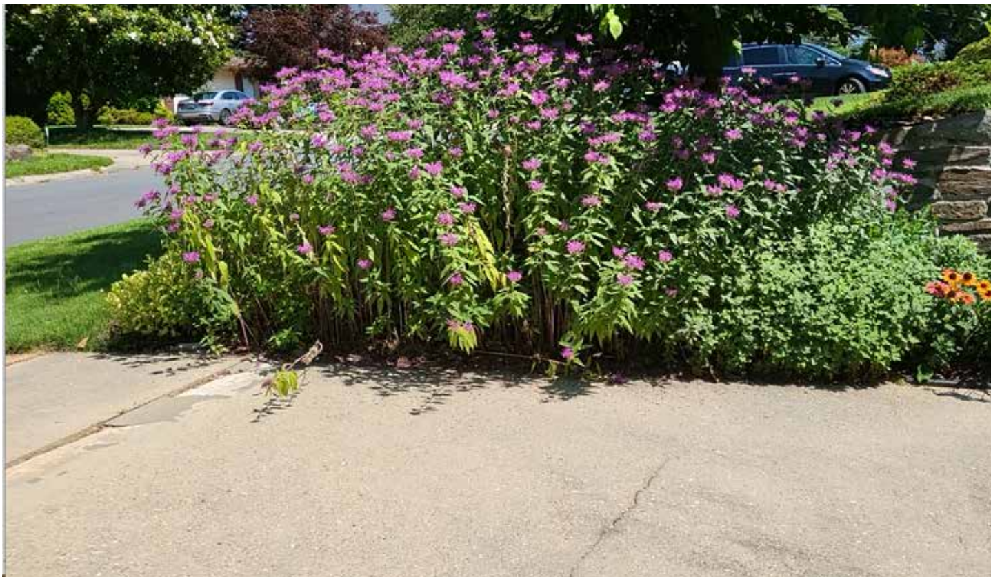
A beautiful, mosquito-resistant flower bed of Bee Balm

Information is available at garden@kpcaonline.org